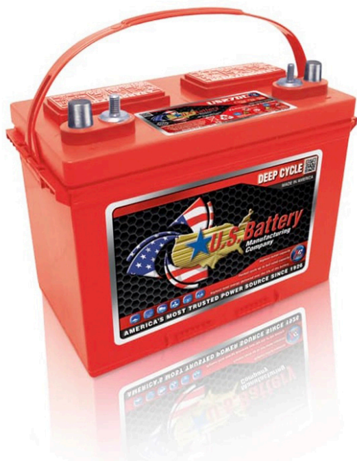
US Battery 12V Deep Cycle Wet